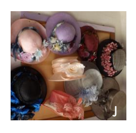
A The Coronation, B The Chancel, C The Commonwealth, D A Pew End, E Diamond Jubilee, F General View, G Accession (Tree House), H Scotland, I Wales, J Hats.